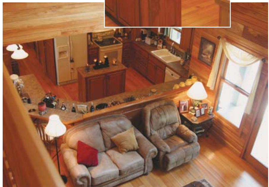
Honey locust walls and cherry-bark red oak floors create a warm glow in the house, which features wood from eight species of trees.