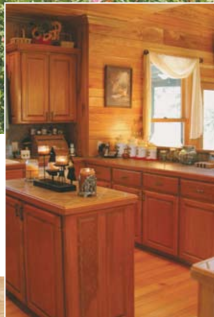
The kitchen cabinets are made of cypress with a cherry stain.

“When we built the house, all the family holidays got transferred to our place,” Jackie says. ■ JH